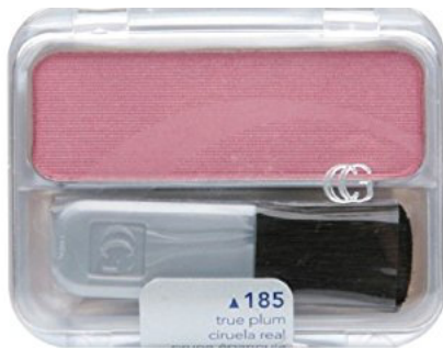
Covergirl Blush Cheekers- #185 True Plum