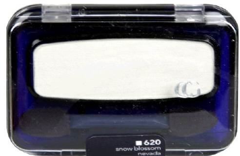
Covergirl Eye Shadow/Highlighter- #620 Snow Blossom