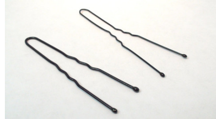
Hair Pins for Buns