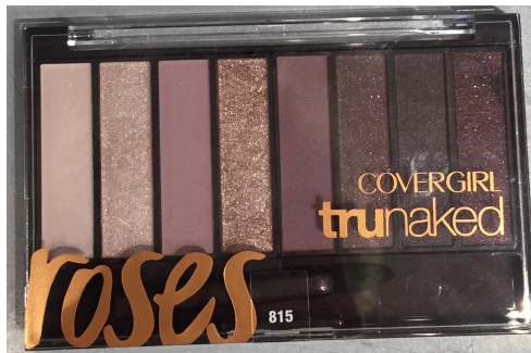
Covergirl Eye Shadow- #815 Roses