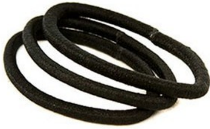
Proper Elastics for Pony Tails